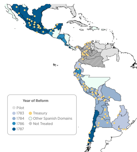
Figure 1 • Royal Treasuries and the Roll-out of the Intendency System

Note: This map shows the geographical extension of each intendency, using different shades of blue to denote the timing of reform. This timing corresponds to the year of arrival of the first intendant to each post. The part of the viceroyalty of New Granada corresponding to present-day Colombia, where the reform was not implemented, is displayed with diagonal black lines. Yellow circles show the location of royal treasuries.